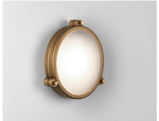
CODE: 1387001 FINISH: ANTIQUE BRASS

THIS PRODUCT IS SUITABLE FOR ONEROUS ENVIRONMENTS AND CAN BE INSTALLED WITHIN FIVE MILES OF THE COAST - THREE YEAR WARRANTY APPLIES.